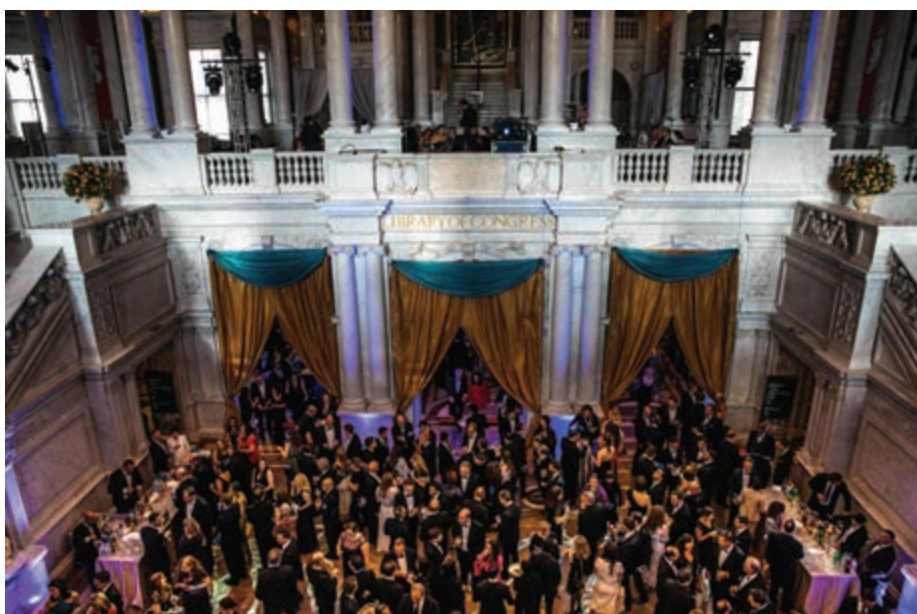
Cocktail party in the Great Hall

Ranking Member of the House Budget Committee. Senator Van Hollen was elected to the Senate in November 2016. Senator Van Hollen serves on the Appropriations Committee; the Subcommittee on Commerce, Justice, Science and Related Agencies; the Committee on Banking, Housing and Urban Affairs; the Subcommittee on Housing, Transportation and Community Development; the Committee on the Budget; and the Committee on Environment and Public Works.