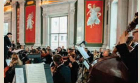
The Pan America Symphony Orchestra