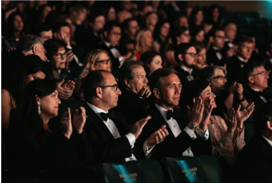
The Burton Awards Program in the Coolidge Auditorium