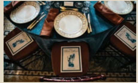
2018 Dinner in the Great Hall