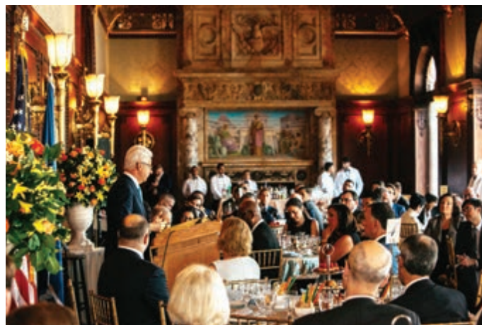
Legends in Law Luncheon, The Members Room