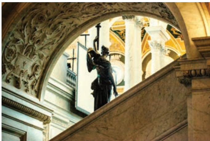
Library Of Congress, The Jefferson Building